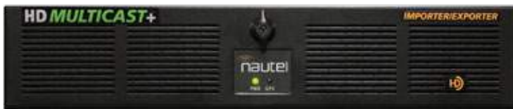
HD MultiCast+ Importer/Exporter